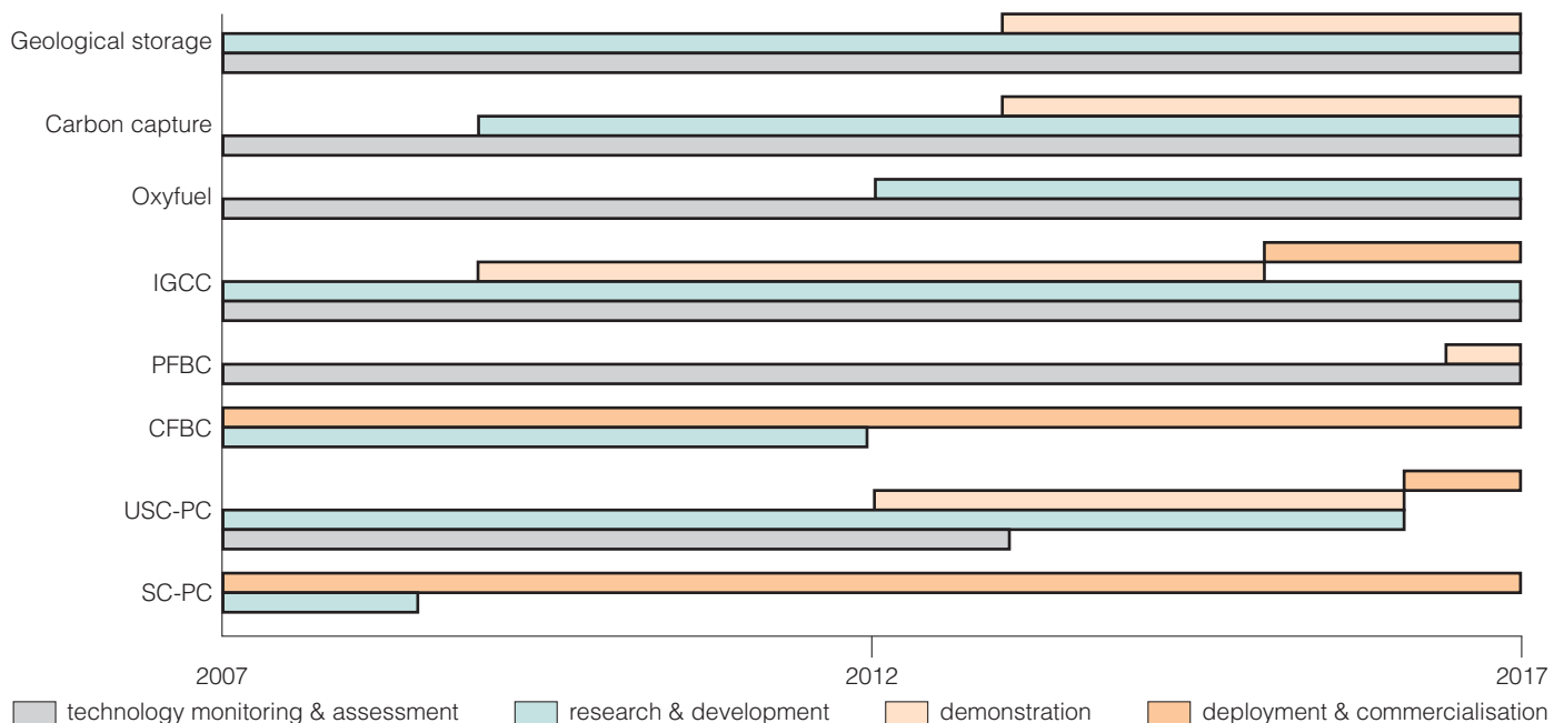
Illustrative roadmap for developing India's power sector, 2007-17